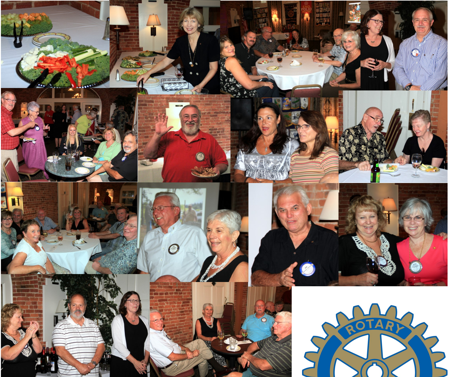
It was a great night of fellowship at our first evening social held at the Holbrooke Hotel on Monday, 9/15.